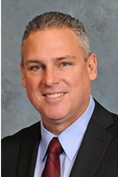
50 th District UIUC alum